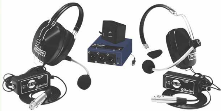
Que Comm Single-Channel Intercom System

Que-Com intercom systems are a compact, cost-effective, portable solution to many intercommunications needs. It consists of a PK-7 intercom power supply, and a choice of either one-ear (SMQ-1) or two-ear (DMQ-2) headset stations with an integral boom mic, attached to a rugged belt-pack housing the electronics. Que-Com systems are compatible with all other Clear-Com party-line intercom products.