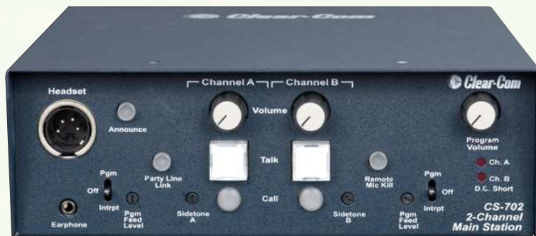
CS-702 Front Panel