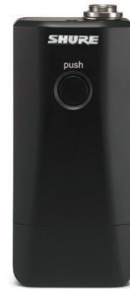
MXW1 Bodypack Transmitter