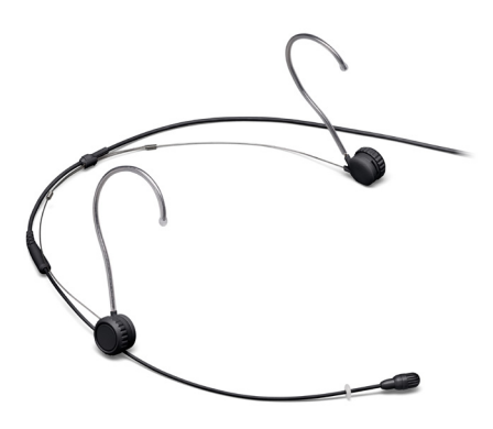
TwinPlex<sup>™</sup> TH53 Subminiature Headset Microphone