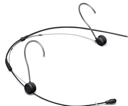
TwinPlex™ TH53 Subminiature Headset Microphone