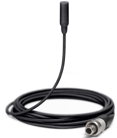
TwinPlex™ TL48 Subminiature Lavalier Microphone