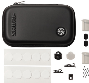
Included Accessories Shown