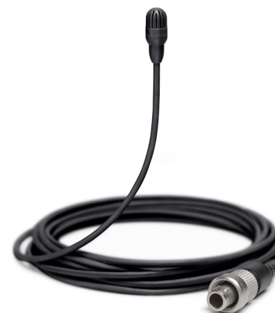
TwinPlex™ TL47 Subminiature Lavalier Microphone