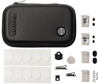
-A Included Accessories Shown