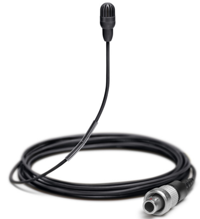
TwinPlex™ TL45 Subminiature Lavalier Microphone