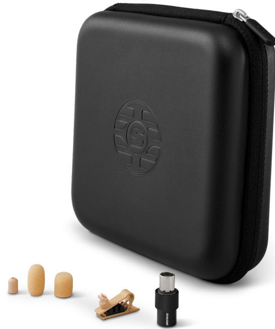
Headset Accessory Kit For MTQG SKUs (shown in tan)