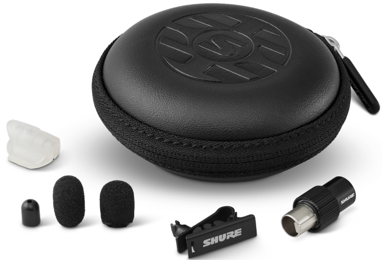
Lavalier Accessory Kit For MTQG SKUs (shown in black)