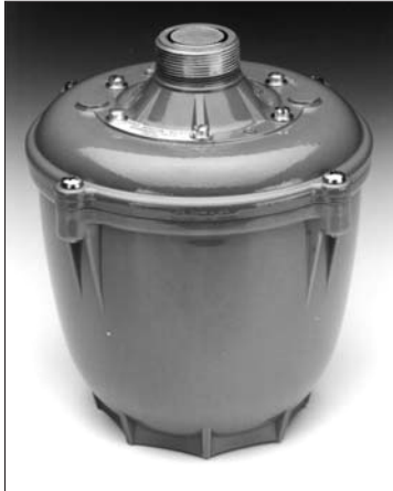
PD-60A / PD-60AT