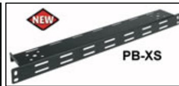
PB-XS mounts PD-815SC and PD-815SC-NS power strips between rackrail