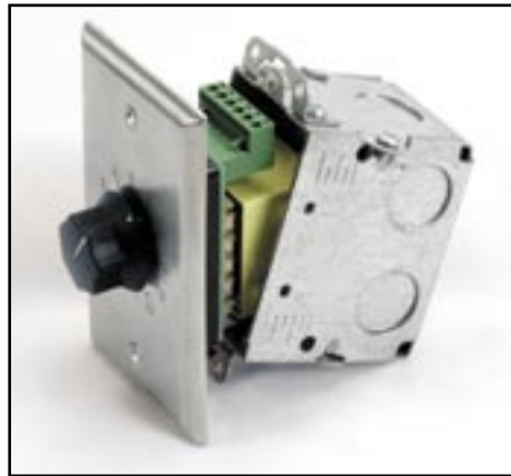
AT100 shown in standard backbox