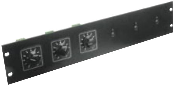
Three AT Attenuators shown mounted on the new Atlas Sound Model AT PLATE-052