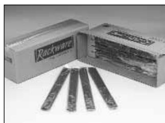
Bulk quantity models "Contractor & Master Cartons for large jobs and distribution