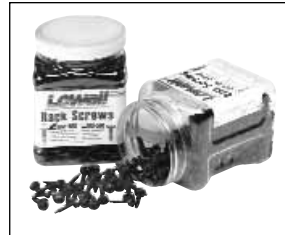
RSP-500 / RS-500 Jars

ALL screws have 5.1 hardness and include PilotPoint™ tip and captive washer!