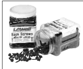
RSP-500 / RS-500 Jars

ALL screws have 5.1 hardness and include PilotPoint™ tip and captive washer!