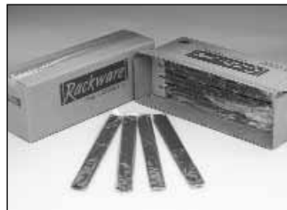
Bulk quantity models "Contractor & Master Cartons for large jobs and distribution