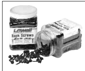
RSP-500 / RS-500 Jars

ALL screws have 5.1 hardness and include PilotPoint™ tip and captive washer!