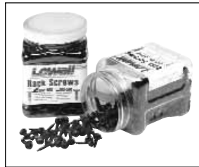
RSP-500 / RS-500 Jars

ALL screws have 5.1 hardness and include PilotPoint™ tip and captive washer!