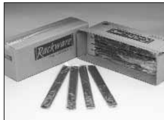
Bulk quantity models "Contractor & Master Cartons for large jobs and distribution