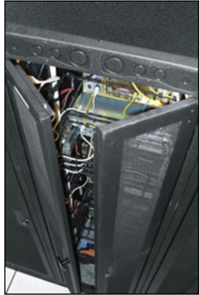
Fully vented split rear door saves space when working behind the rack