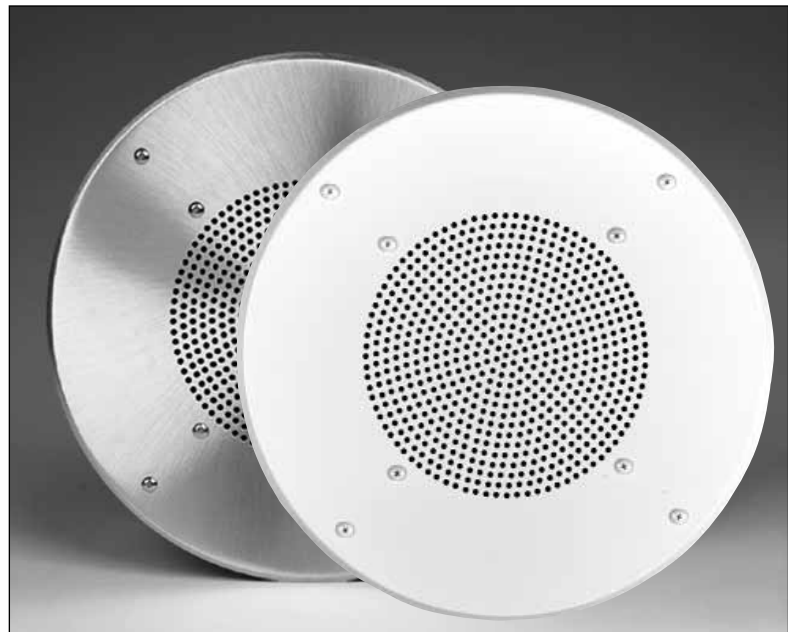
A8-A Aluminum Grille 8 screws, brushed alum. finish

Companion backbox or mounting ring shall be Lowell Model _____. Companion tile bridge or channel rails for suspended installations shall be Lowell Model _____.