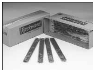
Bulk quantity models "Contractor & Master Cartons for large jobs and distribution