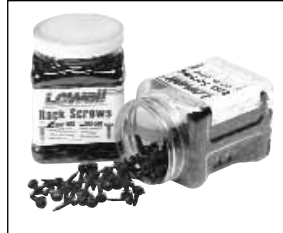
RSP-500 / RS-500 Jars

ALL screws have 5.1 hardness and include PilotPoint™ tip and captive washer!