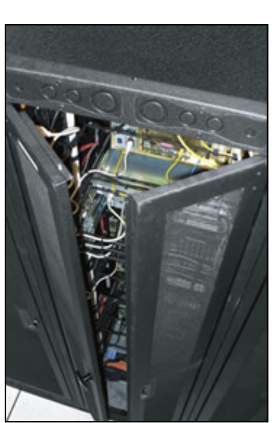
Fully vented split rear door saves space when working behind the rack