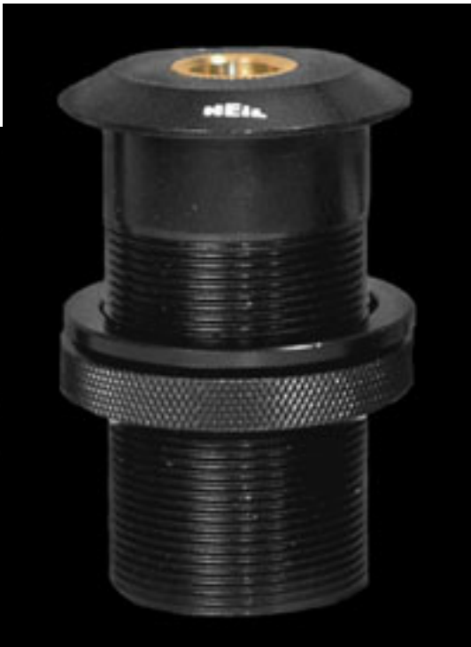
The DT-1 is a flush mount for the PL2T. Drill a 1.5" hole in the desk top, then tighten the large washer and nut of the DT-1 from below the desk. This creates the ultimate in a classy mount for all Heil booms.