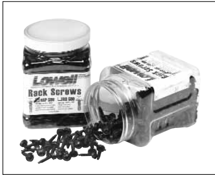
RSP-500 / RS-500 Jars