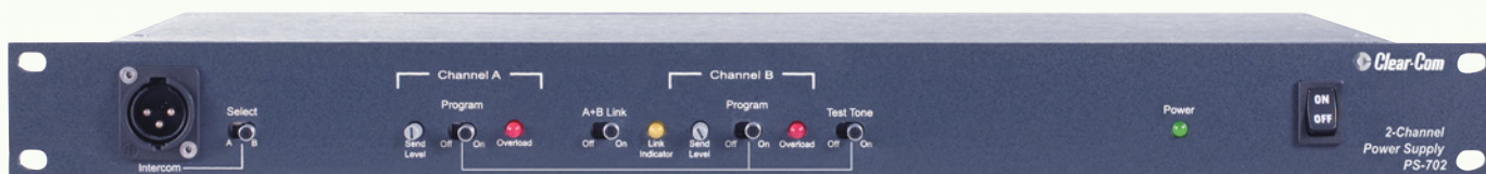
PS-702 Front view

The PS-702 can supply up to 2 amps at 30 volts DC to two channels in a 1-RU. This is sufficient to power up to 40 belt packs, 10 speaker stations, or 12 headset stations even under the most demanding conditions. Either channel is capable of supplying up to 1.2 amps. The full current capacity may be divided between the two channels.