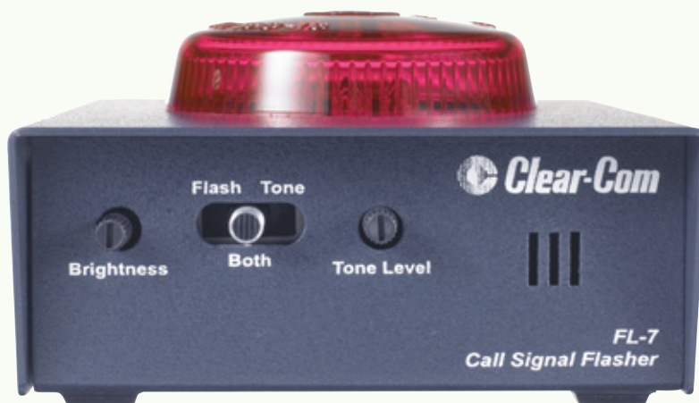
FL-7 Front view

The FL-7 Call Signal Flasher connects to any Clear-Com or compatible intercom system, providing both a visual and an audible indication of a call signal on the intercom channel. The flasher emits a bright amber strobe light twice a second in response to a call.