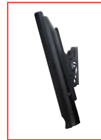
Adjustable +15/-5° tilt

(800) 865-2112 (708) 865-8870 Fax: (708) 865-2941 www.peerlessmounts.com