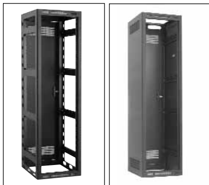
Open Frame Rack Solid Side Rack