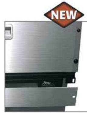
-CATRIM silver finish locking trim panel