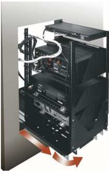
pulls out and rotates 90° in either direction for easy access to equipment connections