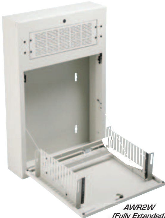
AWR2W (Fully Extended)