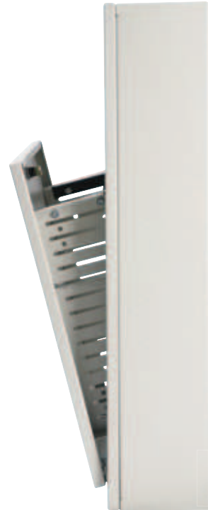
AWR3W (Side View)