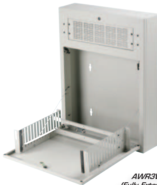
AWR3W (Fully Extended)