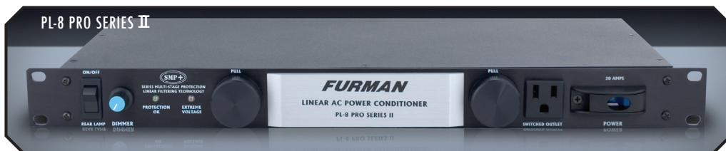
ADDITIONAL PL-8 PRO II FEATURES