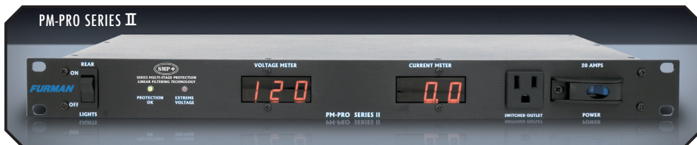
ADDITIONAL PM-PRO II FEATURES