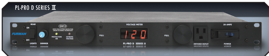
ADDITIONAL PL-PRO D II FEATURES