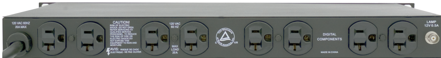
Rear panel identical on all models.

When voltage rises to extreme levels because of a lost neutral line or an accidental connection to 208 or 240 VAC, Furman's Extreme Voltage Shutdown kicks in, automatically powering down all equipment quickly and safely in order to prevent damage from occurring. An indicator LED will then illuminate, alerting you to the situation until the over voltage condition is corrected.