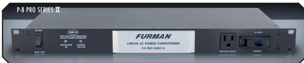
P-8 PRO II