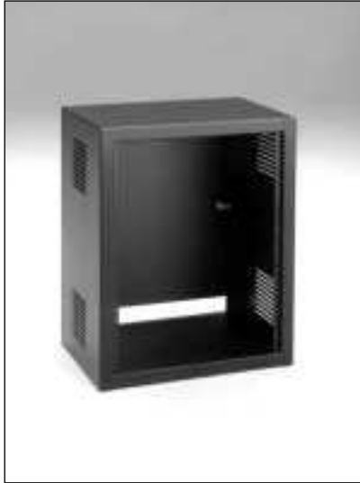
Shown with locking front door