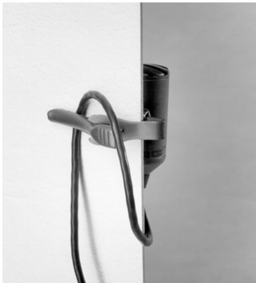
CABLE ANCHORING FIGURE 4

Insert the SM11 in the tie clasp and anchor the cable as shown in Figure 4. Affix the clasp to a tie, shirt, or blouse. Note that the microphone can be swiveled 360° in its holder for left, right, or vertical (“pen clip”) use.