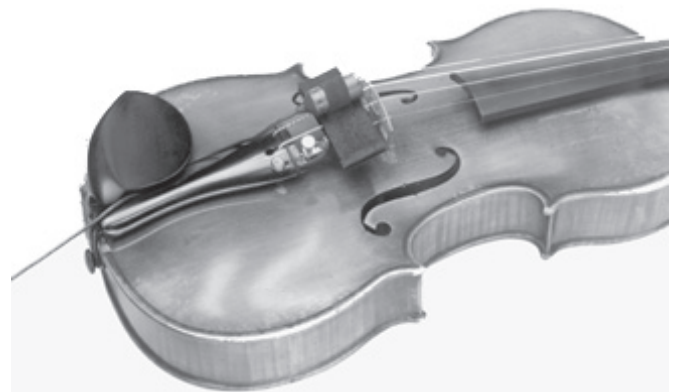
VIOLIN MOUNTING—CLOTH MOUNTING ADAPTER FIGURE 3