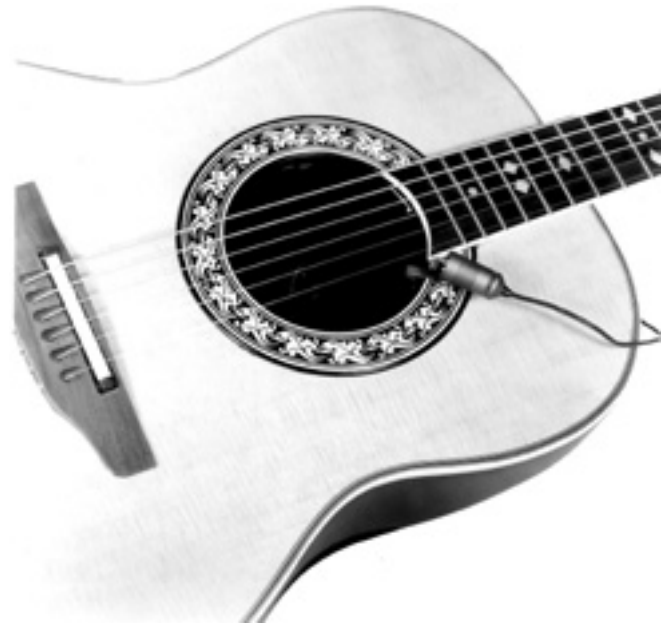
GUITAR MOUNTING FIGURE 4

To hold the microphone cable in place, remove the paper backing from the supplied cable clips, affix the clips to a suitable flat surface, and insert the cable in the clip slot.