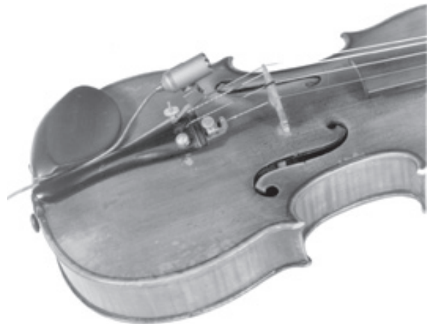
VIOLIN MOUNTING—EXPANSION MOUNT FIGURE 2