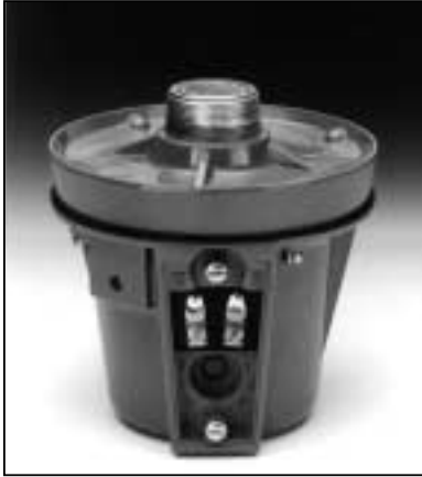
PD-30 / PD-30-16