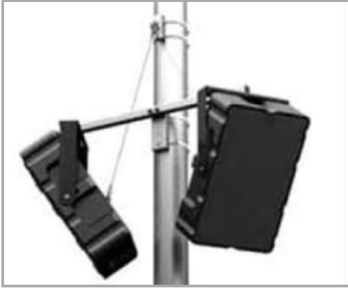
For 6" Diameter Poles & Larger