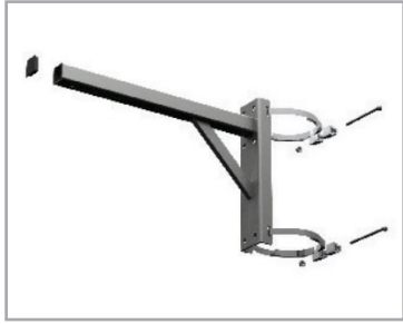
For 2" Diameter Poles & Larger